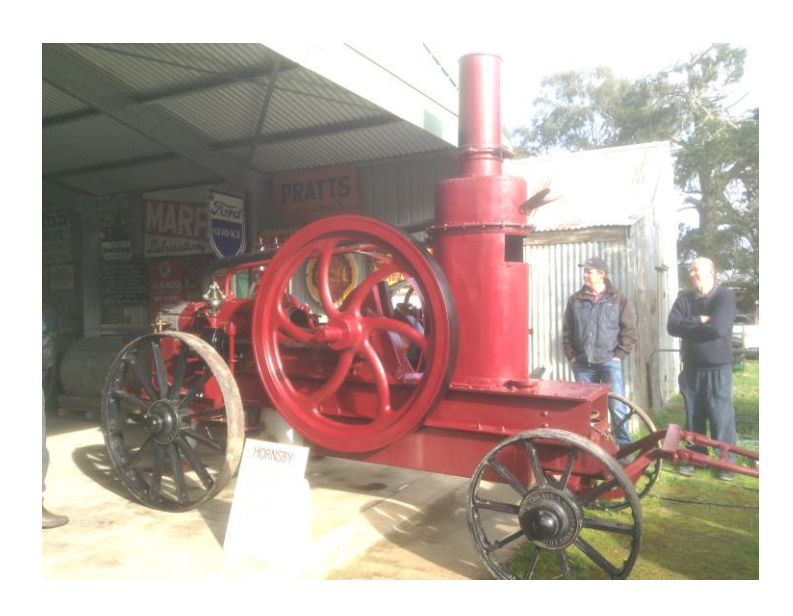
1904 Hornsby Engine